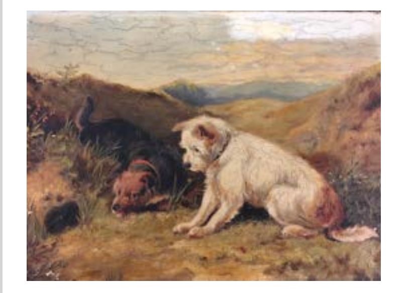
Areas of paint loss filled and restored. Dark areas in the craquelure disguised.

The canvas was wax resin lined to stabilise the surface. Surface clean to remove accretion and discoloured old restoration.