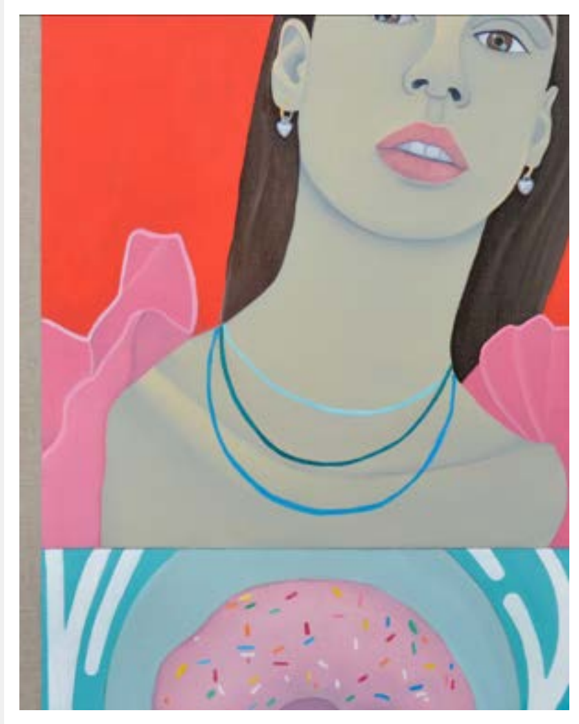
Betty , Oil, Acrylic on Linen, 49 x 39 cm, 2021

The gallery will be open from 10am - 6pm. If at times we reach maximum capacity, there may be a short wait. Alternatively we can offer private viewings with the artist via appointment either at the gallery or on zoom.