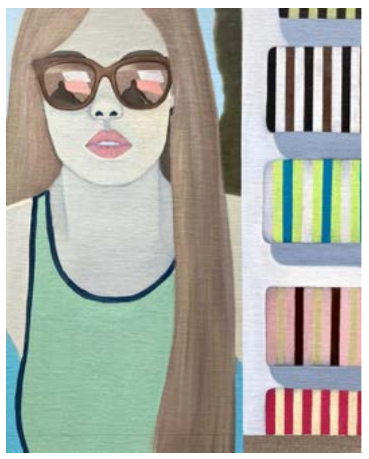
Mercredi , Oil, Acrylic on Linen, 49 x 39 cm, 2020 / Alexa , Oil, Acrylic on Linen, 49 x 39 cm, 2021

The first solo exhibition of paintings by contemporary, Norwich-based, artist Jess Burgess explores the notion of the contemporary woman as she conveys the pressures of presentation and perception.