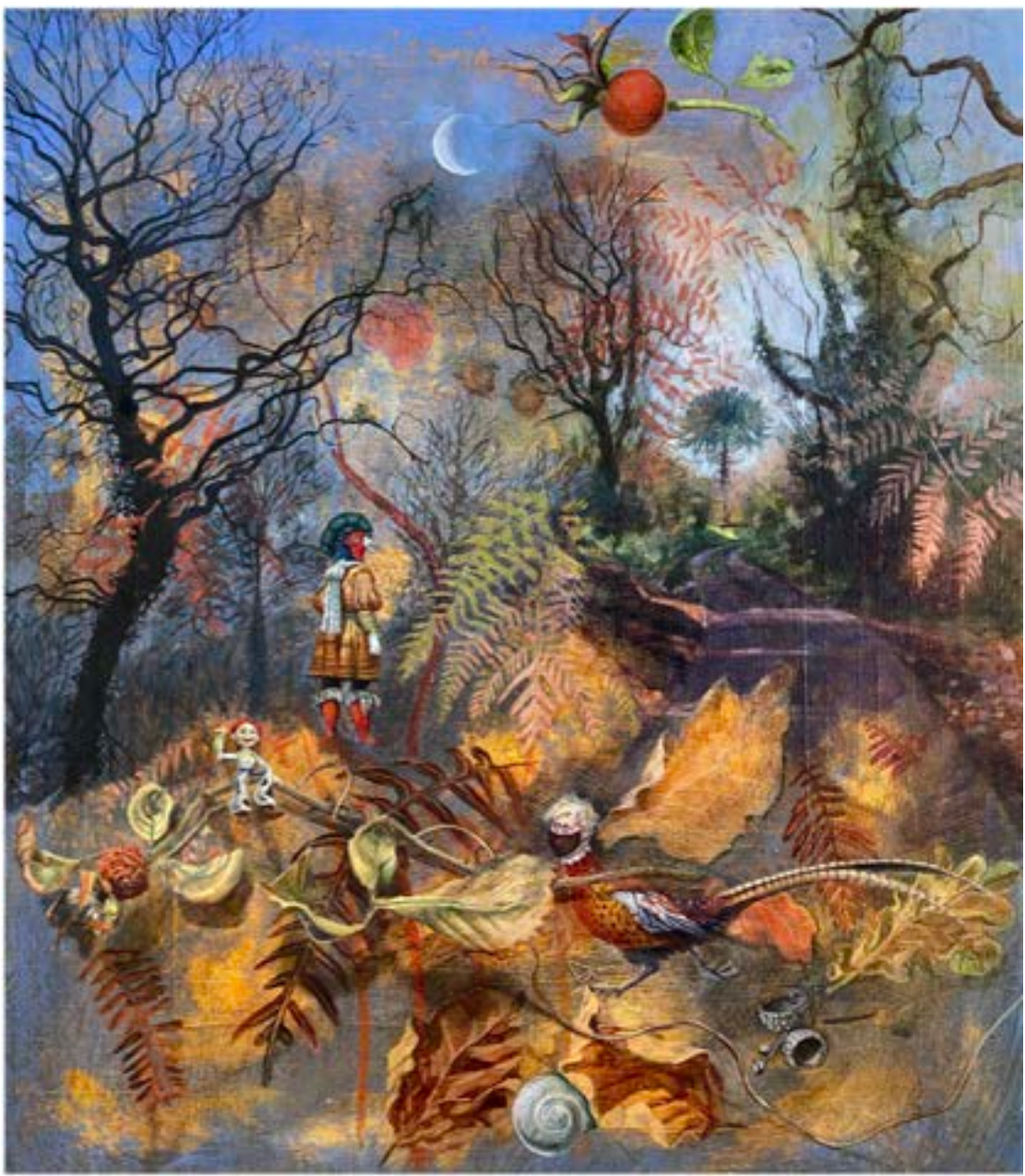
Entangled Reality , Alex Egan, Oil & Acrylic on Board, 39 x 46 cm, £1,045