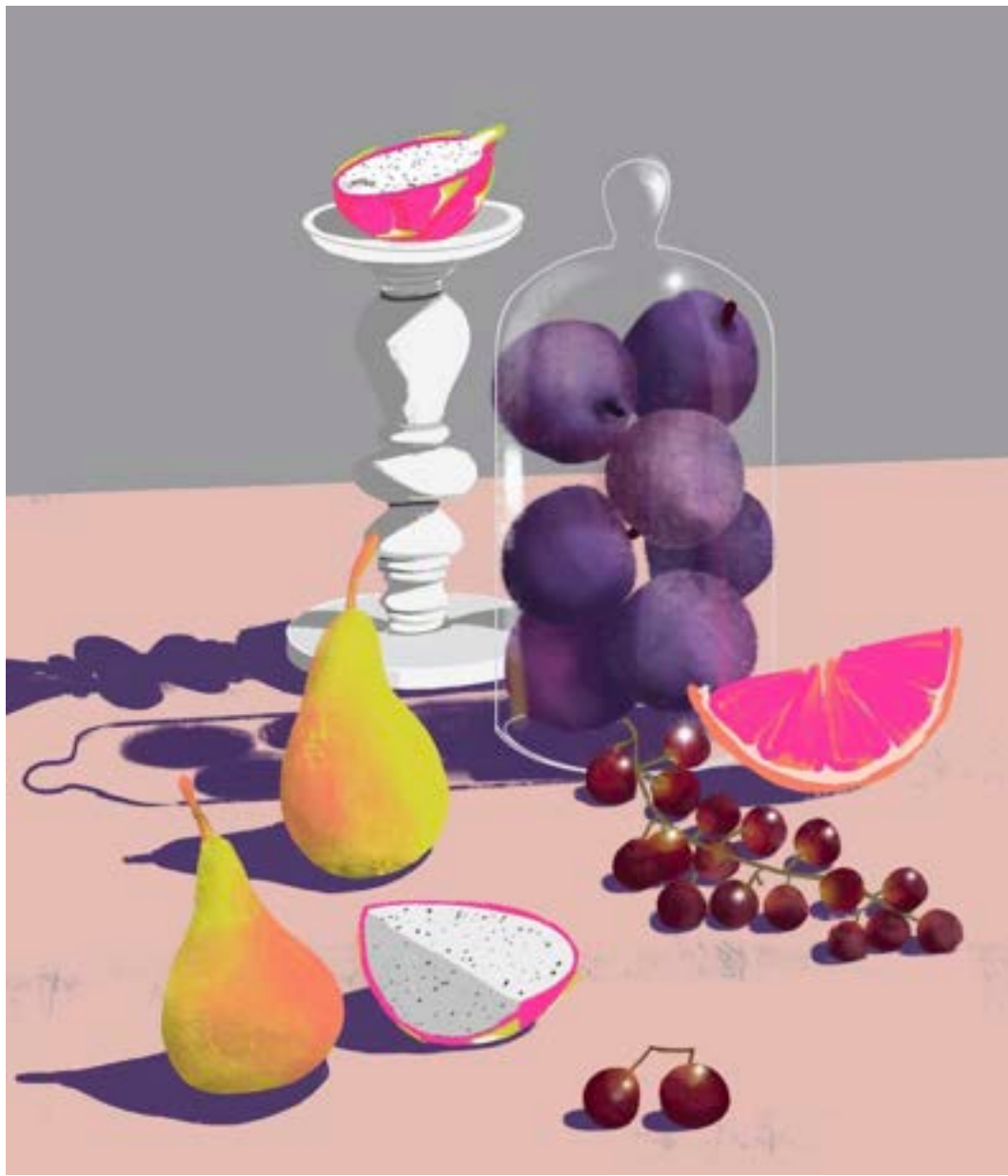
Plums & Pears , Georgina Fairhurst, Digital Painting Giclee Print, A2, £220

Our mixed showcase of works from our artist collection has been refreshed for the new year, with new pieces featured in a display of both contemporary and traditional artworks. The exhibit features paintings, drawings, sculptures and prints from local artists along with restored antique artworks and frames from the Fairhurst framing workshop; a fun mixture of old and new pieces in a range of styles and mediums.