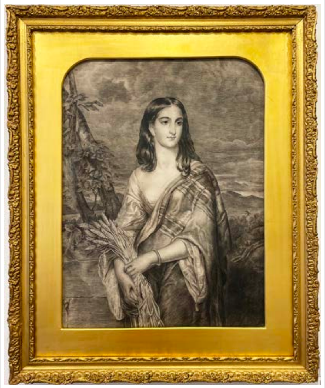
Ruth , Pencil Drawing c.1840s in Early 19th Century Floral Running Pattern Frame, £800

The pencil sketch on paper depicts the biblical figure Ruth. Although unauthenticated, it is believed that this may have been a preliminary sketch by Robert Scott Lauder for his Ruth oil painting, c.1842, given the style and unmistakable similarities.