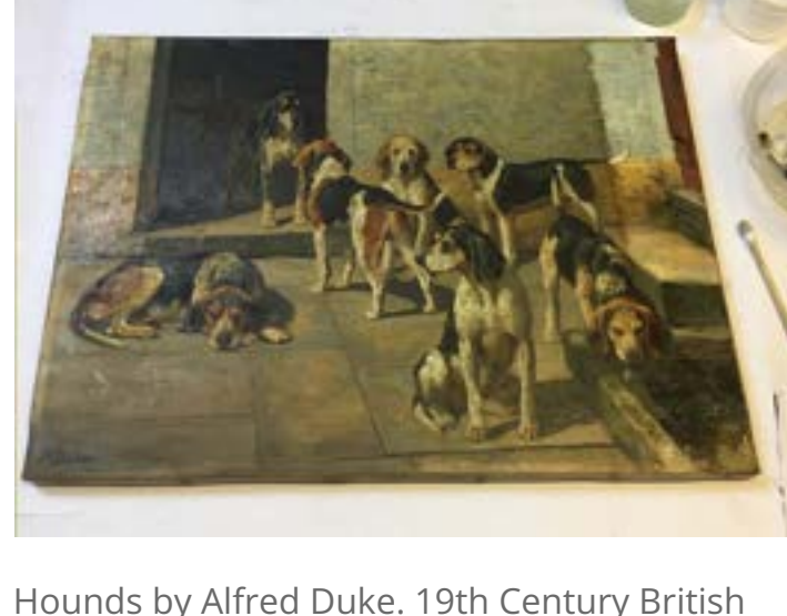
Hounds by Alfred Duke. 19th Century British painter. Oil on canvas. Removal of heavy surface accretion caused my atmospheric dirt such as wood and tobacco smoke.