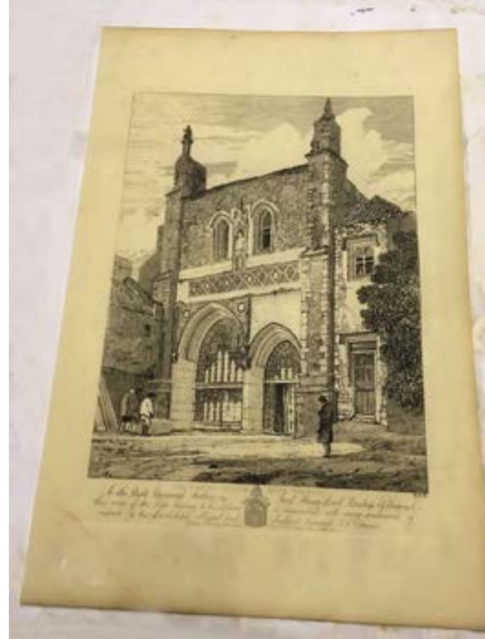
This is a water damaged and foxed John Sell Cotman engraving of the Bishops Gate, Norwich. It has been wet process cleaned.