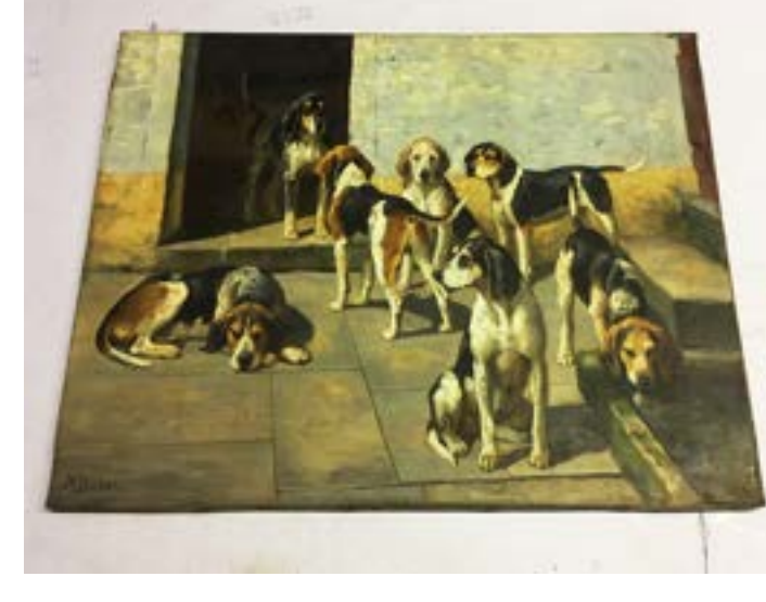
Due to the heavy impasto/texture of the paintwork time was taken to carefully remove the dirty top layer of varnish from all the nooks and crannies. Varnished with a microcrystalline satin wax varnish.