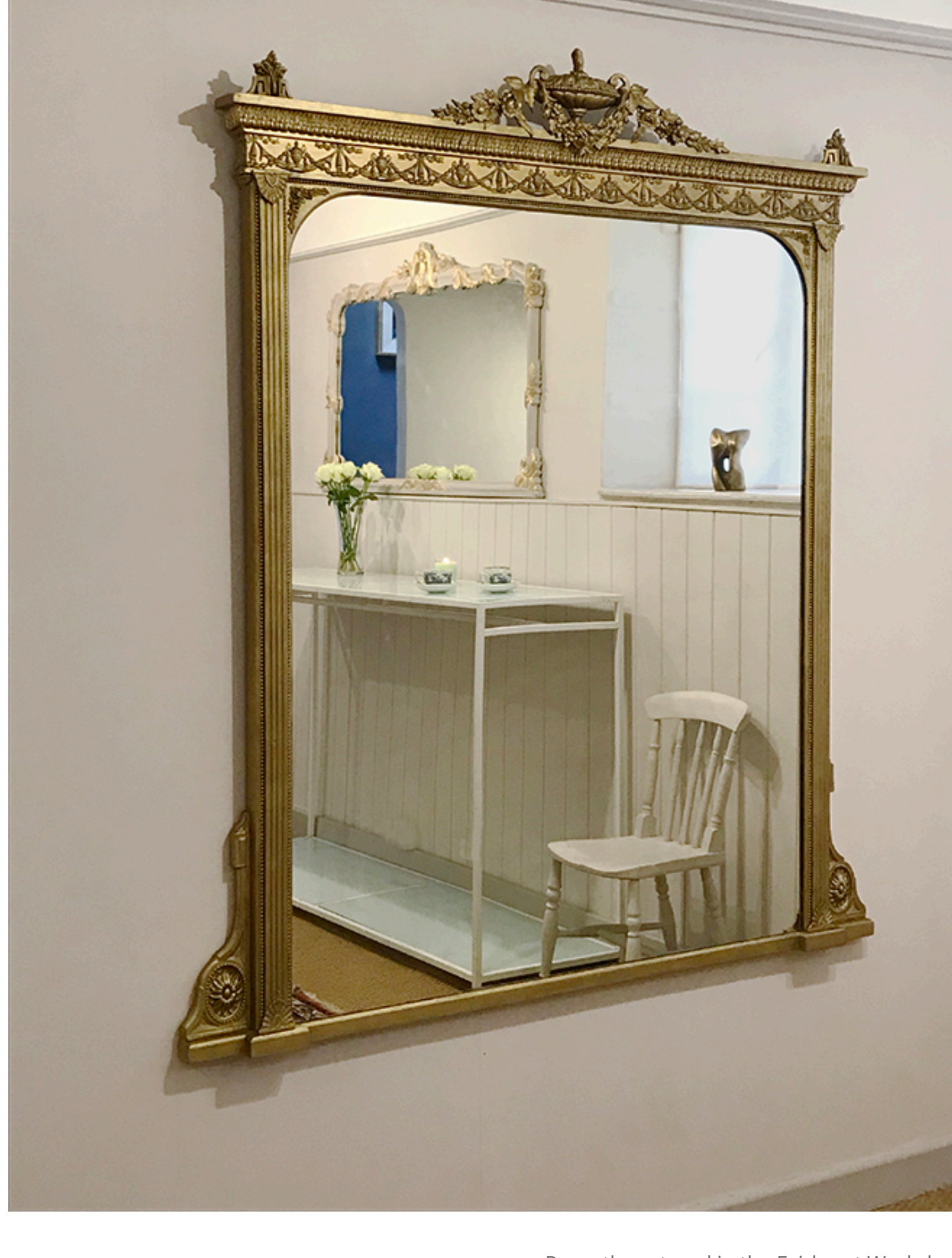
Recently restored in the Fairhurst Workshop 1883, gilt, over-mantle mirror £1500