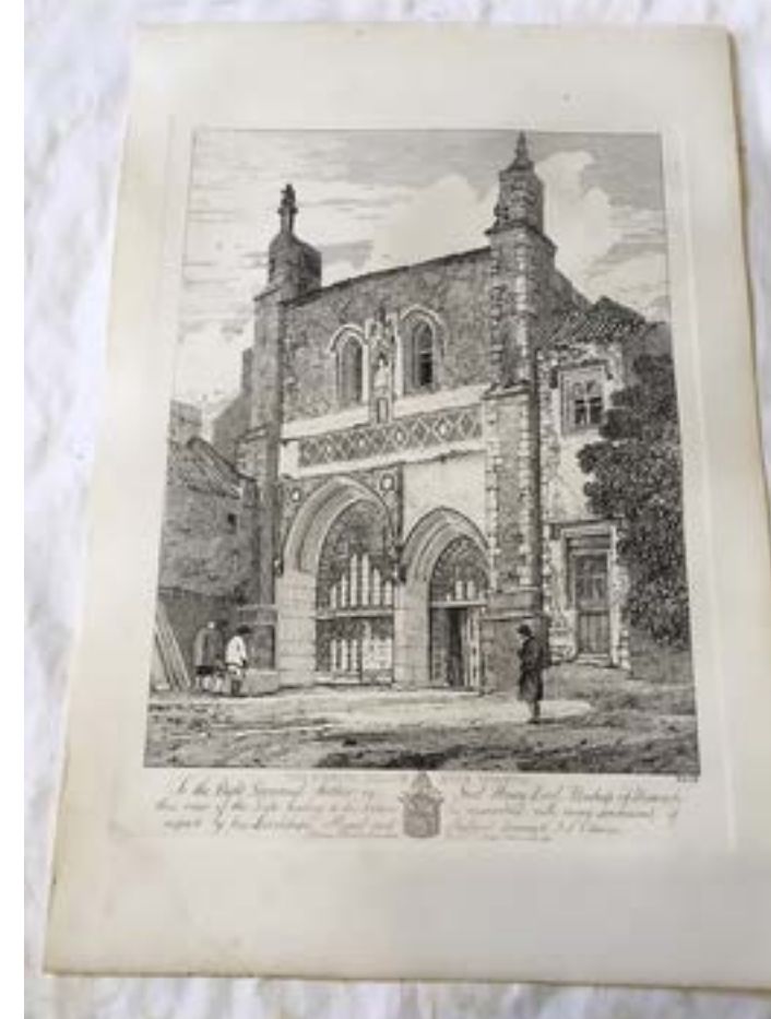
Although the tide line from the water damage hasn't fully been removed the overall appearance of the print has been vastly improved. After cleaning the paper is then re-sized and stretched to conserve the structure of the paper.