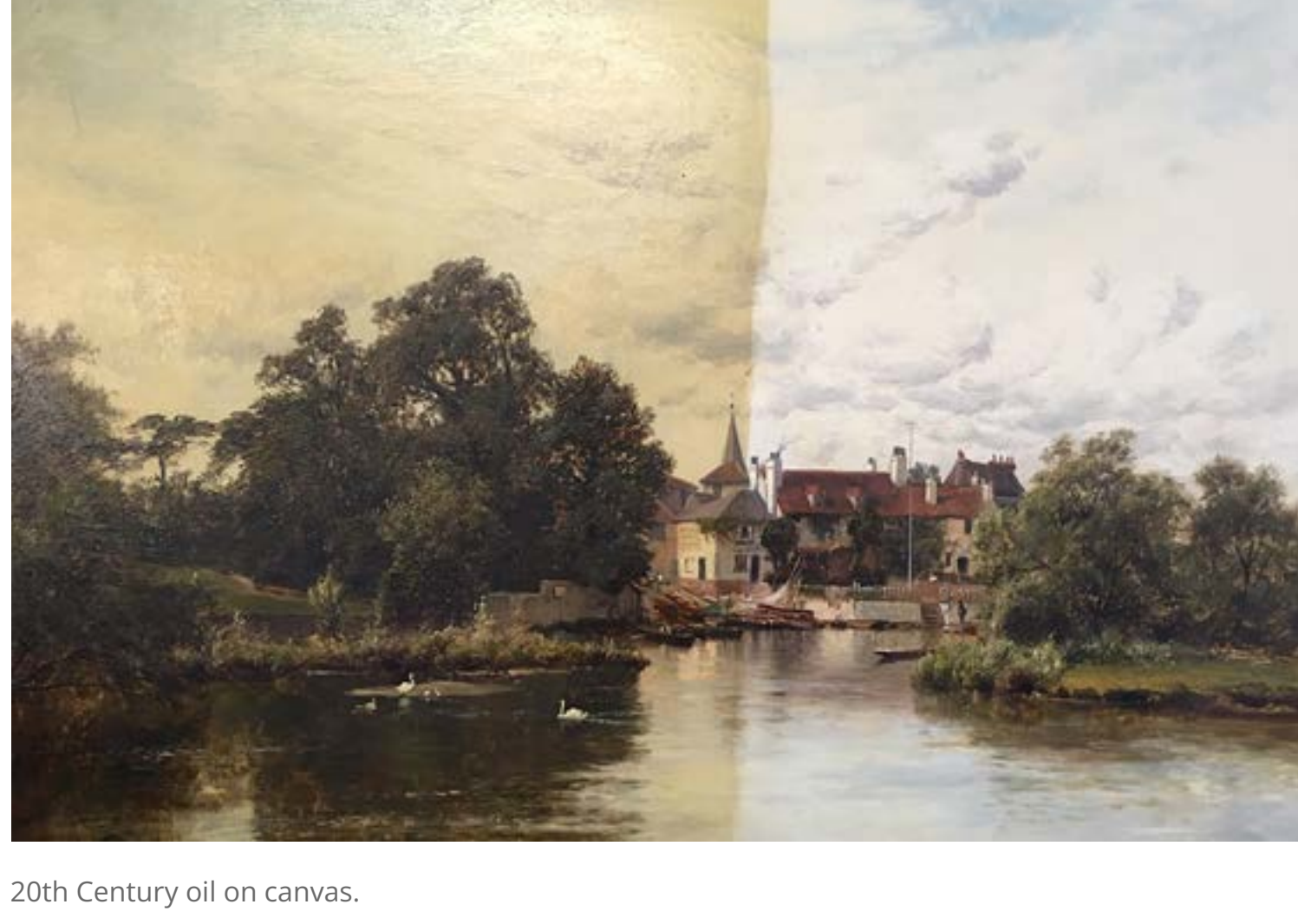
20th Century oil on canvas. The Swan at Ditton by Alfred Breanski. Removal of heavy surface accretion caused by atmospheric dirt such as wood/tobacco smoke and fly dirt. Varnished with a microcrystalline wax varnish.