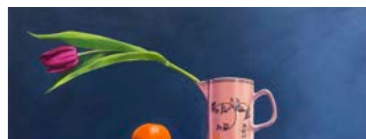
Stripy Jug and Lemon, Oil on Wood Panel, 25 x 51 cm / Pilly's Jug with Tulip and Satsuma, Oil on Wood Panel, 25 x 51 cm

For all enquiries please visit our website, here Alternatively, contact us at enquiries@fairhurstgallery.co.uk ;