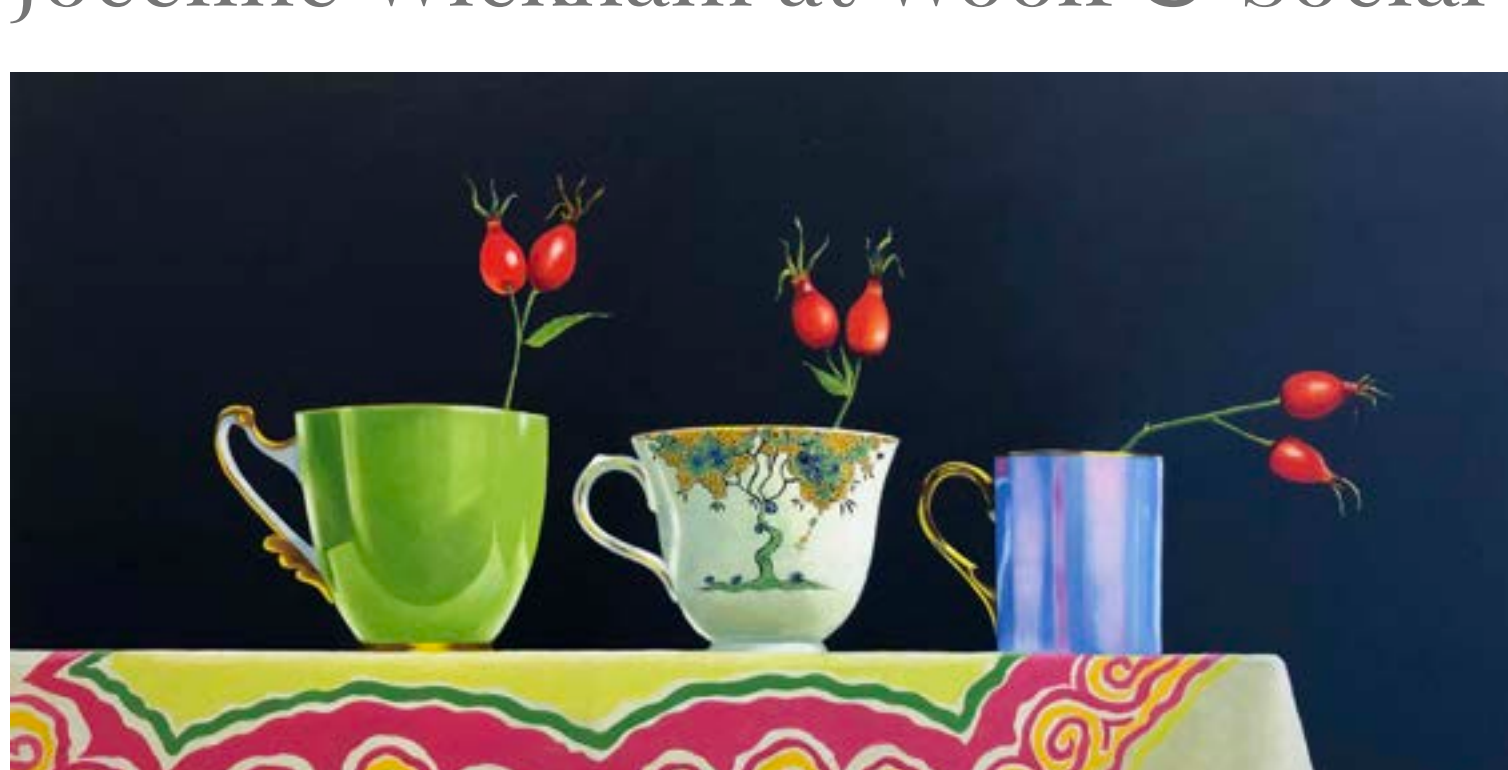
Three Cups and Six Roshpis, Oil on Wood Panel, 25 x 51 cm